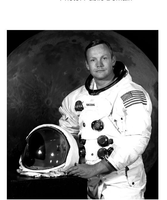
Astronaut Neil Armstrong, commander of the Apollo 11 mission and the first human to walk on the surface of the moon on 20 July 1969