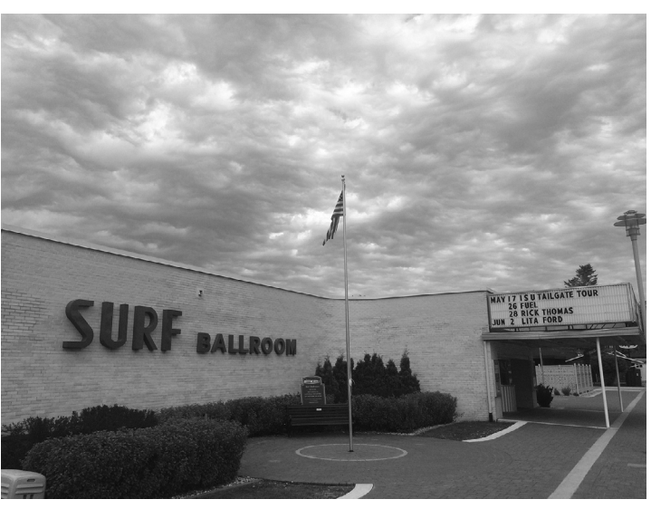
The Surf Ballroom, where Buddy Holly played his final concert in Clear Lake, Iowa on 2 February 1959, just hours before his tragic death in a private plane crash