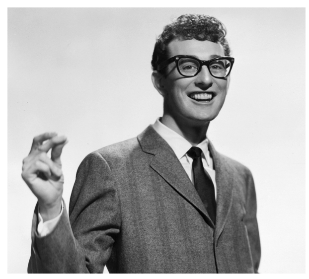
Rock 'n roll legend Buddy Holly (1959)